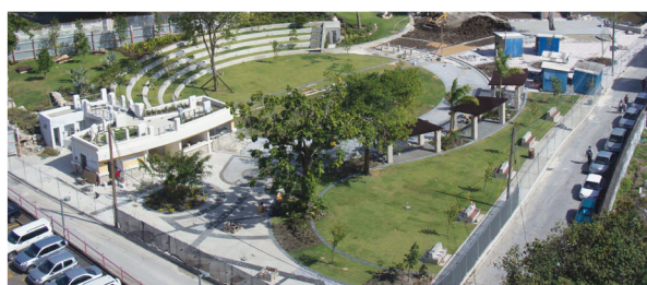
Church Village Green

Every Barbadian of working age has a role to play in securing our country's future. By each of us setting a demanding standard of performance in our life and work, and committing ourselves fully to achieving or exceeding that standard, we will ensure that we have personally made our contribution to the enhancement of national productivity, and helped to fortify the market strength of the Barbadian brand. That is the surest way to make our country an even more formidable competitor in every international activity in which we are engaged, and thereby ensure the future prosperity of our country and of all Barbadians.