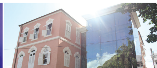
The Exchange Museum in Bridgetown