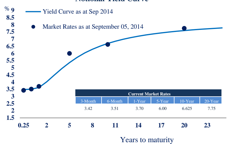
Figure 1 - Barbados Government Securities Notional Yield Curve

This bulletin provides selected market statistics on the most recent Treasury Bill (T-bill) auction and liquidity in the banking system<sup>2</sup>. In addition, an updated notional yield curve as at the last issue date and the relative indicative yields at the end of the previous quarter, are included to provide market guidance on the general direction of domestic interest rates. Given the underdeveloped secondary market in Barbados, market prices and yields for securities issues across the full maturity spectrum are not readily available. Therefore, to estimate a notional yield curve the coupon rates for the respective issues are employed as proxies for yields. An interpolation technique was used to derive interest rates for tenures where no Government securities were outstanding. This process also generates a smooth notional yield curve.